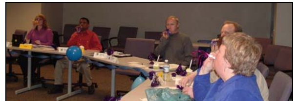
Blowing our own horns with enthusiasm

Thanks so much for the invitation (to the party). It's good to see that LTS is such an exciting, thriving club. I wish I could still attend the meetings, and I wish I could celebrate with the club in person. I'm so thankful that LTS came along when it did. Toastmasters has helped me tremendously. I used to experience major anxiety just from trying to leave voicemails for coworkers. Now I can easily speak in front of a group of 30, which I recently did as Toastmaster for the Area 53 contest. I know LTS is helping others with similar problems all the time and even helping some become professional speakers. Keep up the good work! Live long and prosper, LTS!