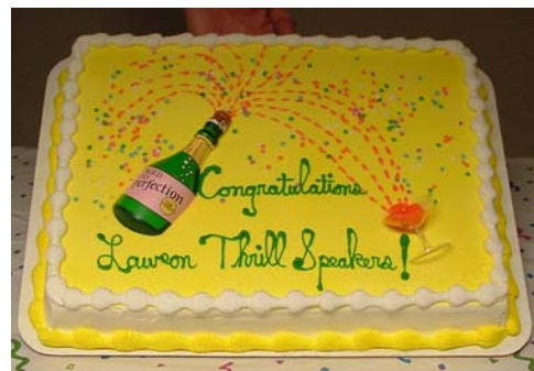
See Page 6 for more photos

Lawson Thrill Speakers celebrated with enthusiasm and pride on March 25, 2004.