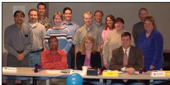
Club members - 2 nd year birthday party

Practice: Each time you answer a table topic using a strategy, you improve. Make answering table topics a game by using different strategies. You will make answering more fun for yourself and the audience.