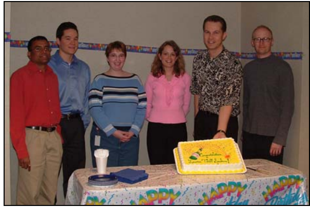
Waiting for the big moment...cut the cake and enjoy!