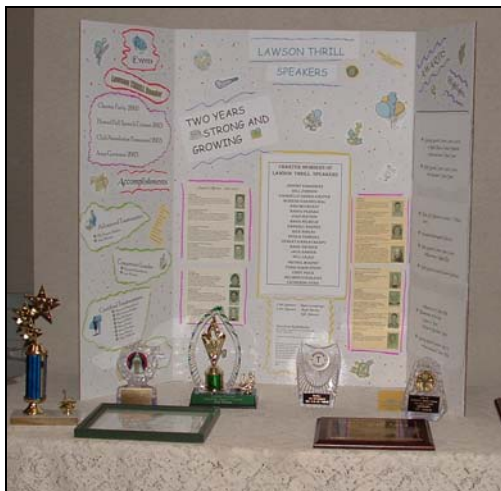
A tribute to all the achievements of our club members!

Tell everyone I am SO proud of what I hear and read that club members have accomplished. LTS has truly become one of the stellar clubs in District 6! The club has stepped forward in quality meetings, leaders within and outside the club, and top-notch contestants.