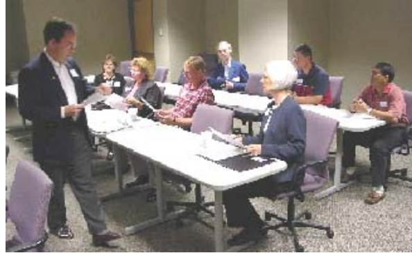
Chief Judge preps the judges