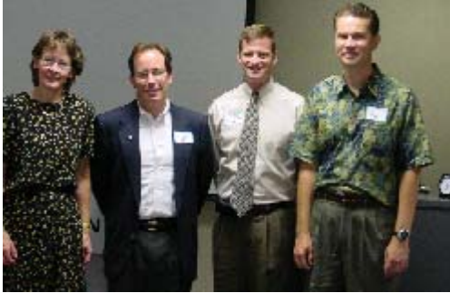
A spare moment before the contest