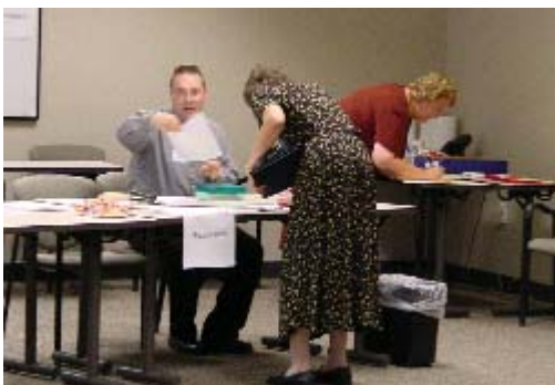
Taking care of the business of registration

Eastern Division Winner 3 rd Place CONGRATS