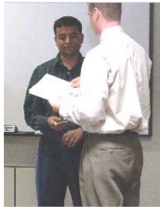
Accepting Certificate of participation

Eastern Division Winner 3 rd Place CONGRATS