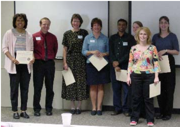
Contestants after the competition